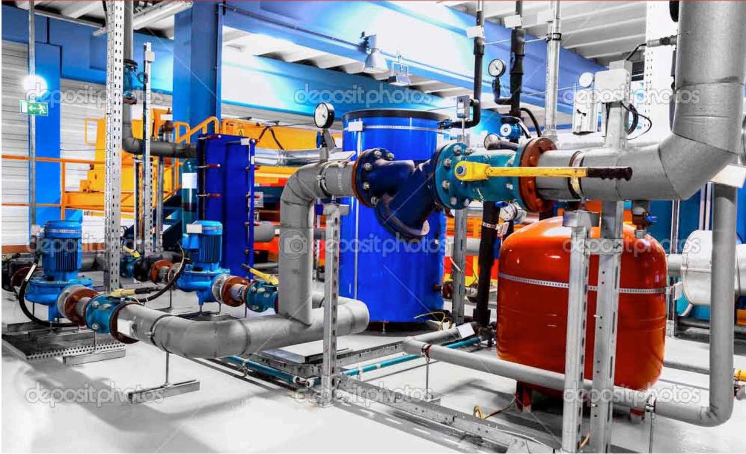
A typical process plant has a large network of pipes and equipment

Engineering design is a very stringent process and it involves various considerations including natural calamities, especially earthquakes. The use of this engineering design even in process plant piping is no exception. This article that gives insight into analyzing the seismic effects on the design of pipes. Using an assortment of analysis techniques, the results are presented herein.